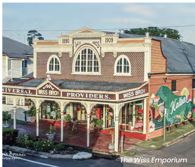
The Wiss Emporium