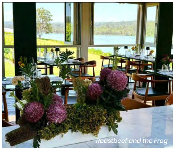
Roastbeef and the Frog

For pure indulgence, check into Mount French Lodge, luxuriously set on a 100-acre escarpment with commanding views over the Scenic Rim landscape.