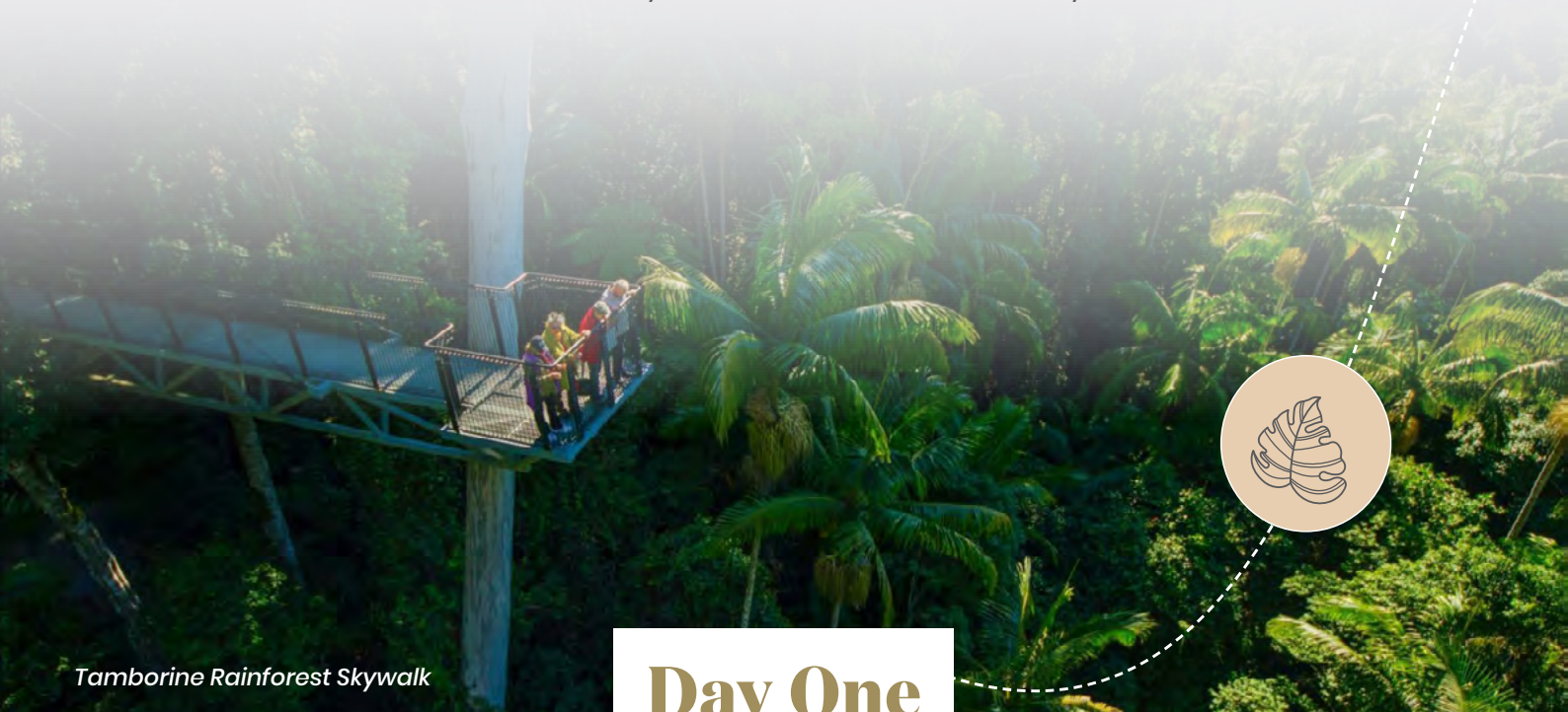
Tamborine Rainforest Skywalk

This three-day itinerary is for the adventurous, whilst balancing the mountain's natural beauty with its best food, wine and stays.