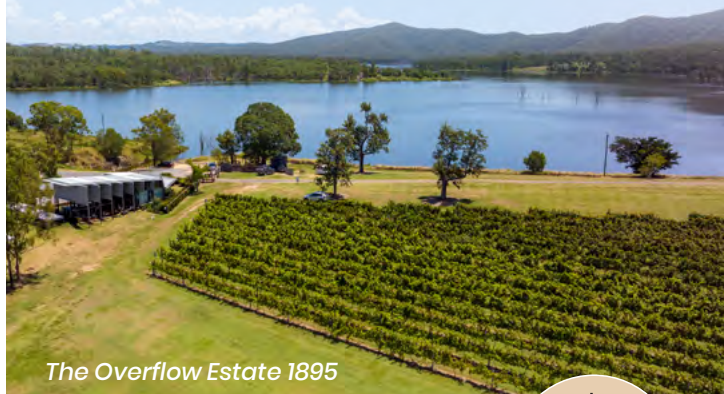
The Overflow Estate 1895

Go all-out for your final night, staying at Wander at the Overflow 1895. The secluded accommodation offers you the chance to reconnect and experience the transformational power of travel.