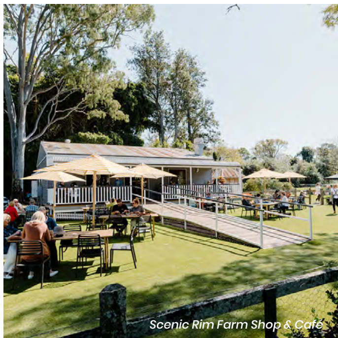
Scenic Rim Farm Shop & Café

From Aratula, take the scenic drive to Lake Moogerah, where the road curves toward a wide, glassy dam framed by rugged peaks. Pull over, stretch your legs, breathe in the mountain air, stroll across the dam wall and enjoy one last pause before looping gently back to Kalbar and the journey home.