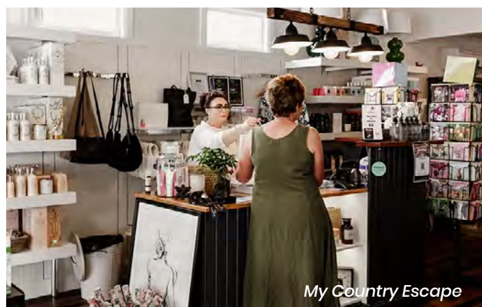
My Country Escape

From here, continue on to Sarabah Estate Vineyard for lunch. Set beside the Albert River and framed by vineyards, Sarabah is known for its seasonal menus and relaxed long lunches that feel distinctly European in spirit but firmly local in flavour. Expect regional produce, estate wines and an atmosphere that encourages you to stay longer than planned.