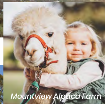
Mountview Alpaca Farm