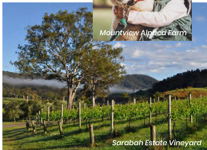
Sarabah Estate Vineyard

In the afternoon, drive to Mountview Alpaca Farm for a gentle and unexpectedly joyful experience among their resident alpacas. Wander the paddocks, learn about the animals and perhaps meet an Alpaca or two before continuing on to O'Reilly's Canungra Valley Vineyards for a final tasting in the late afternoon sun.