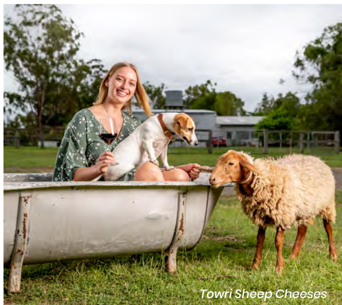
Towri Sheep Cheeses